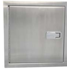
XTS WITH OPTIONAL CHROME LATCH

(F6) Chrome Lockable Compression Paddle Latch, Optional Colors for XTA