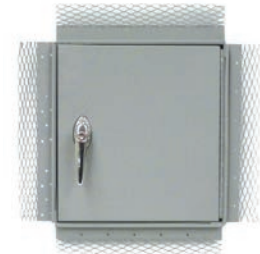
MODEL XPEA WITH OPTIONAL LOCKING HANDLE