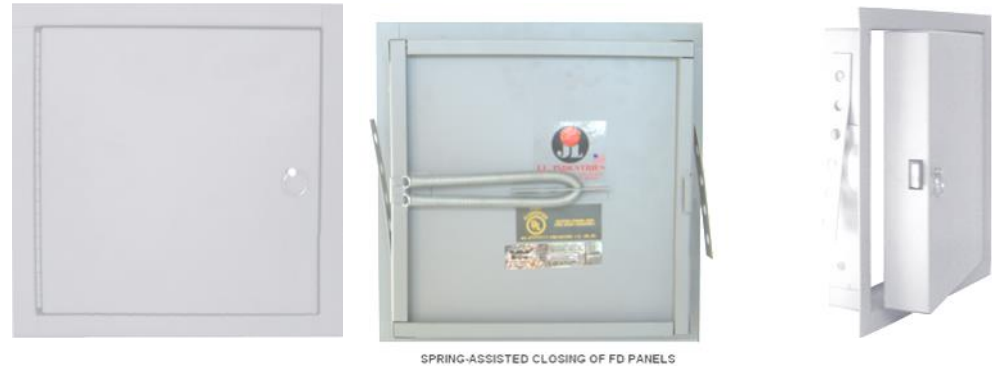
Detail of Wall Model

G-Gray, R-Red, BK-Black, FB-Flat Black, S-Sand, AB-AMS Beige, SB-Flat Beige, B-Bronze, SI-Silver