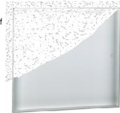
Panel shown as partially-covered by acoustic tile

Sizes: Minimum 6" x 6" (152.4 x 152.4 mm), maximum 36"x 36"