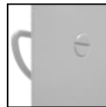
Standard Cam Latch