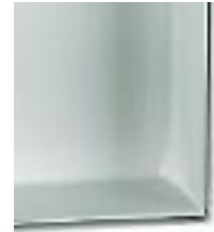
Recessed Door Accepts 1/2" Insert

Please Note - Color Codes and Lock Option Codes have Changed.