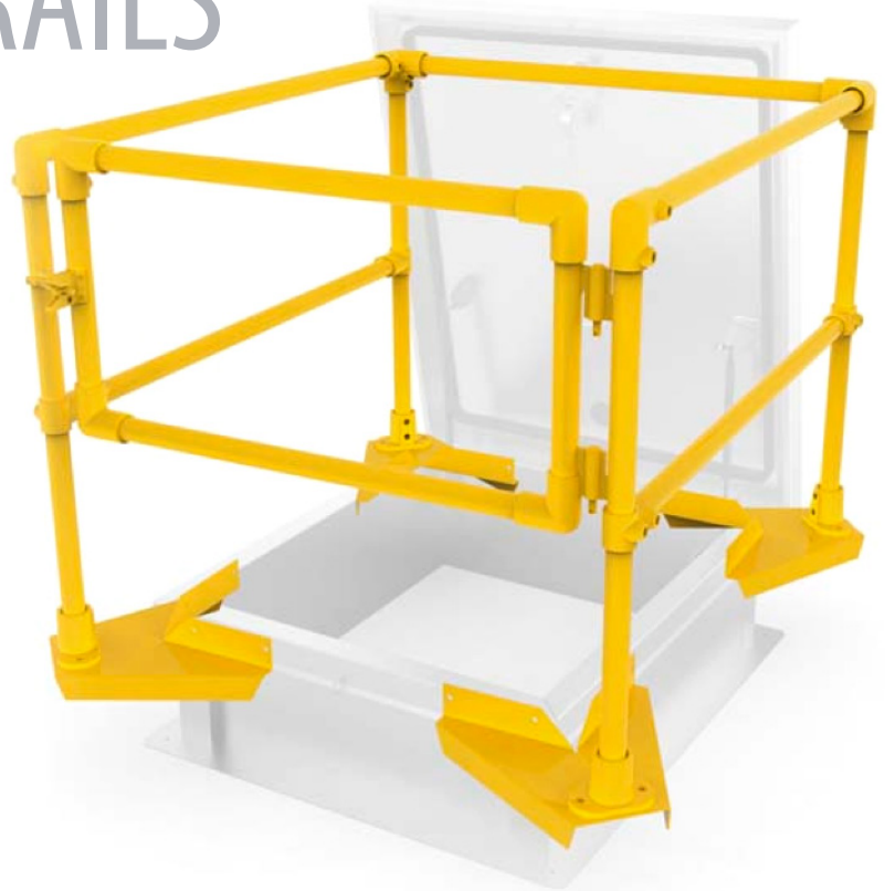
ROOF HATCH & SAFETY RAILS FRONT VIEW (ROOF HATCH COVER REMOVED FOR A BETTER VIEW OF THE RAIL SYSTEM)