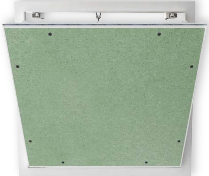
FOR WALL INSTALLATION, HINGE SHOULD BE LOCATED AT BOTTOM

Wall opening is normal door size plus +3/8" (9.5mm) For detailed specifications see submittal sheet