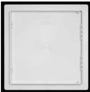
PA-3000 View of door back